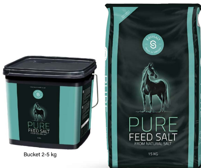
Bucket 2-5 kg